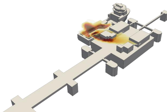
Heatmap of ammonia AEGL3 footprint on deck and jetty from an accidental release scenario during shore-to-ship bunkering taking into account uncertain wind condition