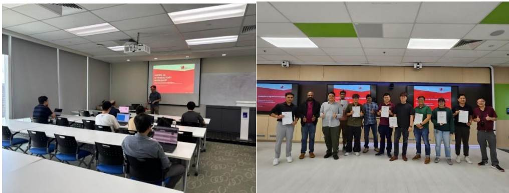
Attendees of the introductory workshop for ASPIRE 2A (left) and participants from the 10th intake of CoC in Introduction to HPC (right).

NSCC Singapore organised an introductory workshop for ASPIRE 2A and welcomed the 10th intake of Certificate of Competency (CoC) in Introduction to HPC participants.