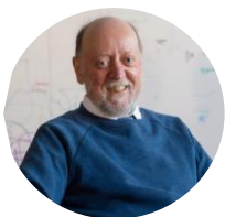
Prof. Jack Dongarra, Professor Emeritus University of Tennessee

Jack Dongarra specialises in numerical algorithms in linear algebra, parallel computing, advanced computer architectures, programming methodology, and tools for parallel computers. He holds appointments at the University of Manchester, Oak Ridge National Laboratory, and the University of Tennessee.