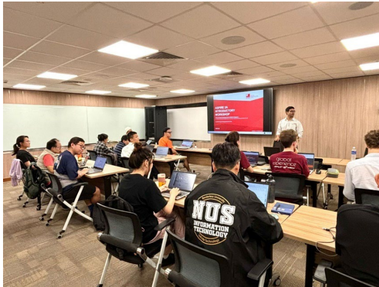
Attendees at the Introductory Workshop for ASPIRE 2A

NSCC Singapore organised two workshops to engage users of varying HPC experiences.