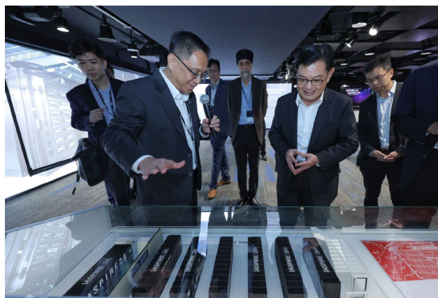
Dr Terence Hung guiding DPM Heng on a tour of NSCC Singapore's Data Centre.

ASPIRE 2A and ASPIRE 2A+ are already delivering impactful results. A notable example is the Third National Climate Change Study (V3), conducted by the National Environment Agency's Centre for Climate Research Singapore (CCRS). NSCC Singapore's supercomputers were instrumental in producing Southeast Asia's highest-resolution climate projections, downscaling global climate models from 100 km to 2 km over Singapore. This simulation, which analysed over 3,000 years of climate data in just four years, provided policymakers and businesses with essential insights to prepare for extreme weather, heat stress, and rising sea levels, safeguarding Singapore's infrastructure and economy.