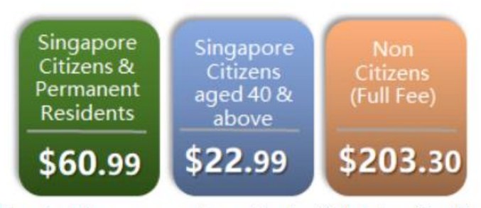
Fees for this course can be paid using SkillsFuture Credits